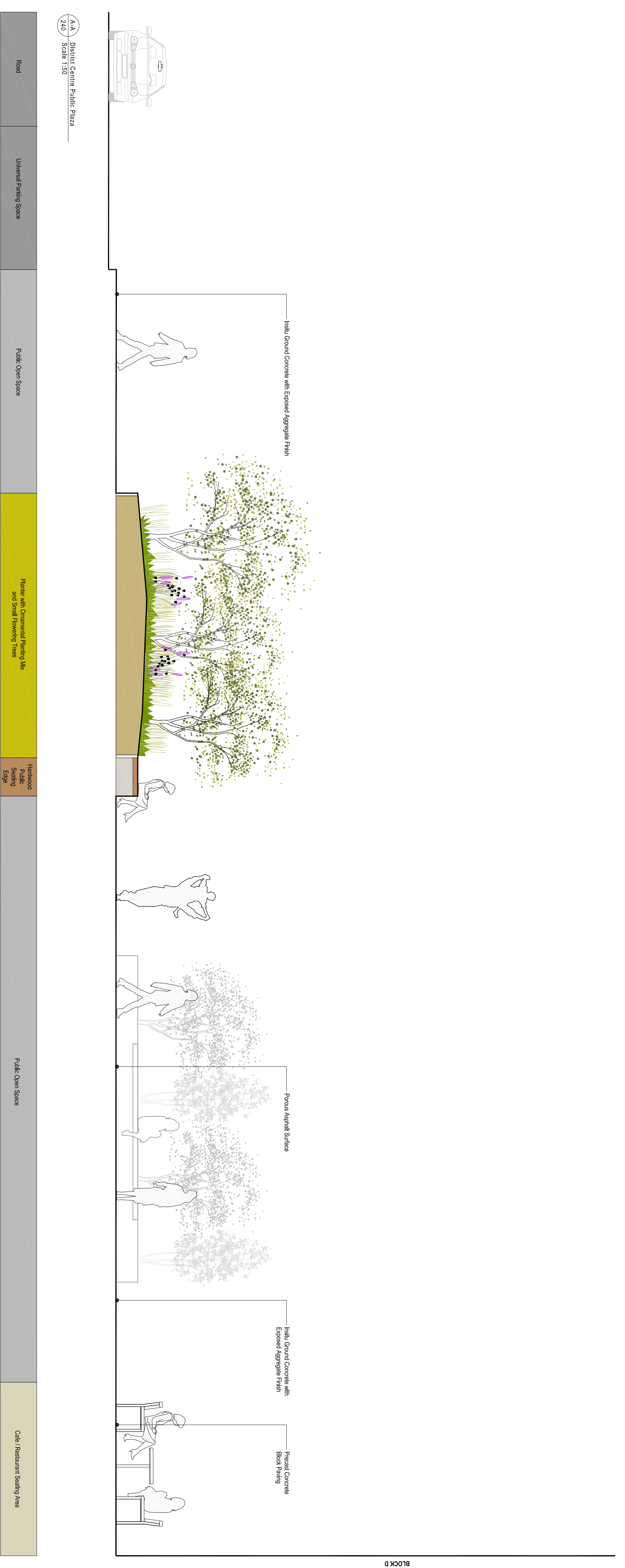
A-A District Centre Public Plaza 240 Scale 1:50